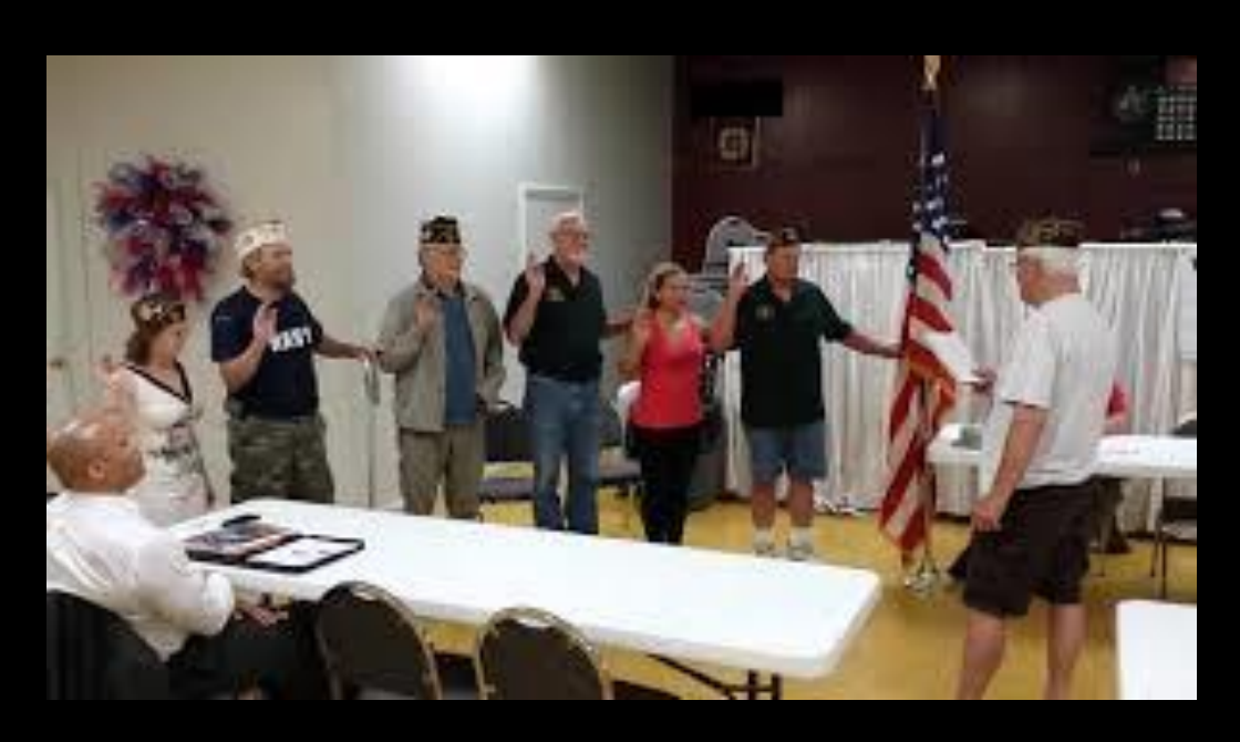
Post 755 Swearing in Ceremony