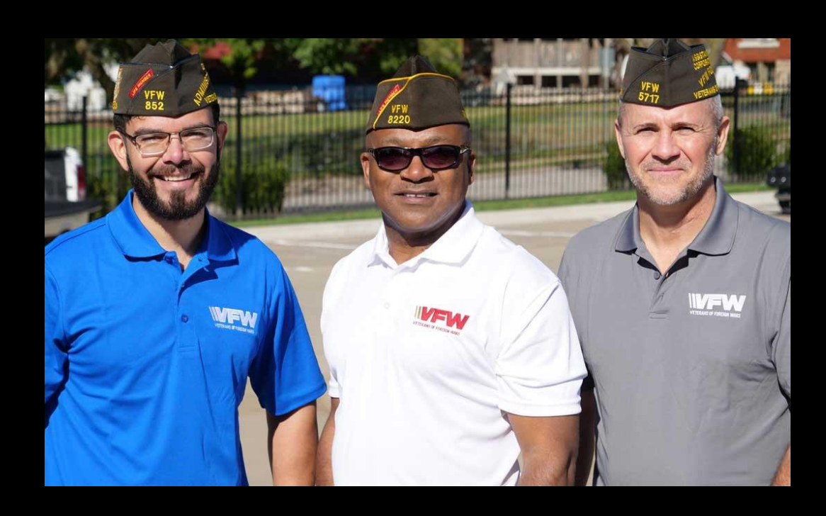
Veterans helping Veterans

Since 1899, the VFW has been the nation's leading veterans service organization in the fight to better the lives of all those who have worn the uniform of the United States military. No matter which conflict called you to service, more than 1.5 million members of the VFW and its Auxiliary continue to fight for all that's good FOR VETERANS.